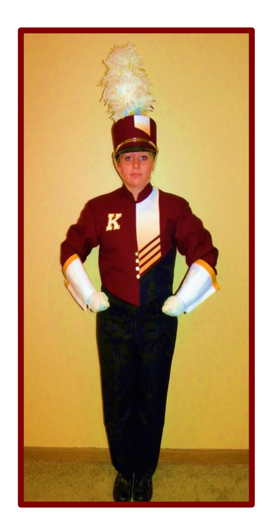
Show your WILDCAT PRIDE! Support the KHS Marching Band As they MARCH into the Future

THE KALIDA HIGH SCHOOL MARCHING BAND UNIFORM CAMPAIGN